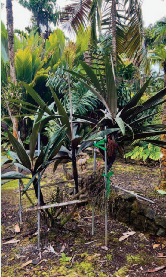
Ripening seed, ex-situ cultivation in Hilo, Hawaii.