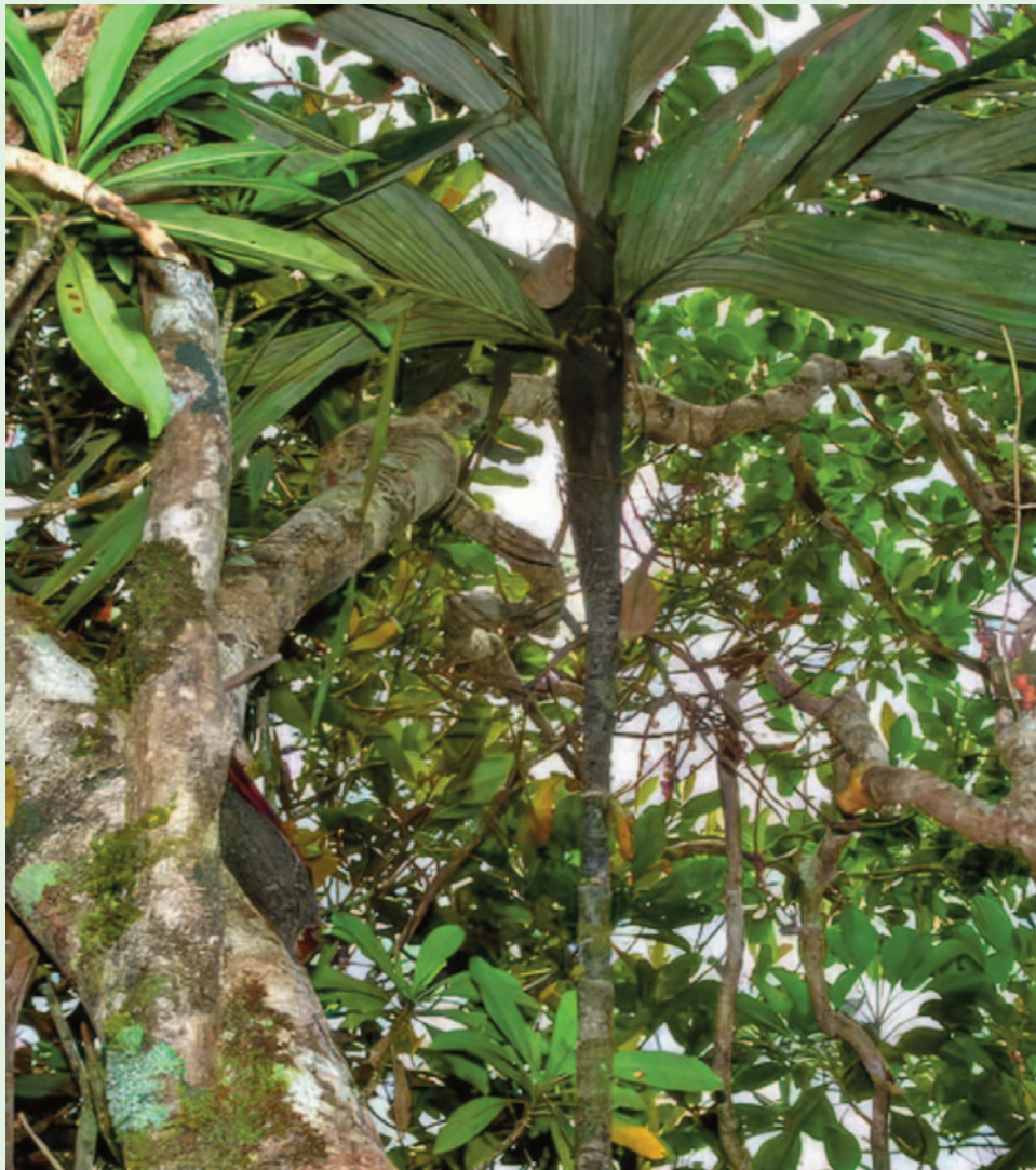
Basselinia vestita in habitat, New Caledonia.