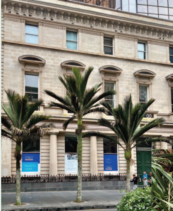
Rhopalostylis baueri in downtown Auckland.