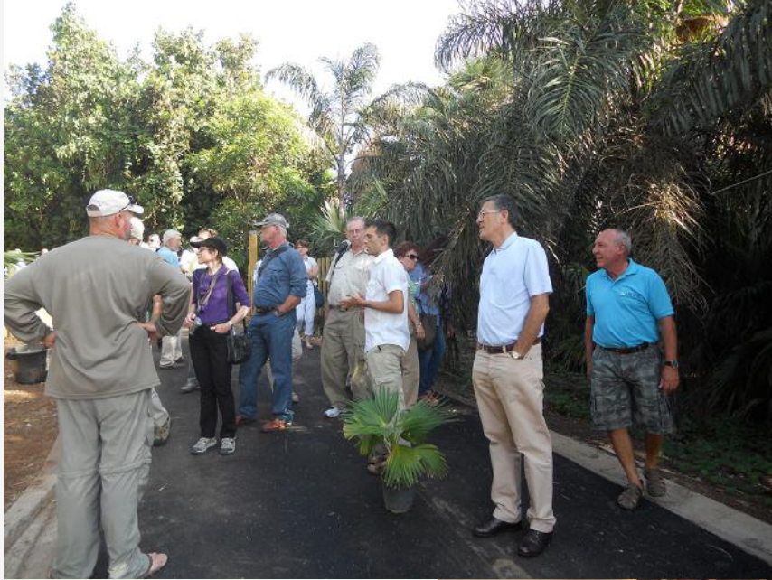
2011: Tenerife, Canary Islands, Spain, October 13-17.