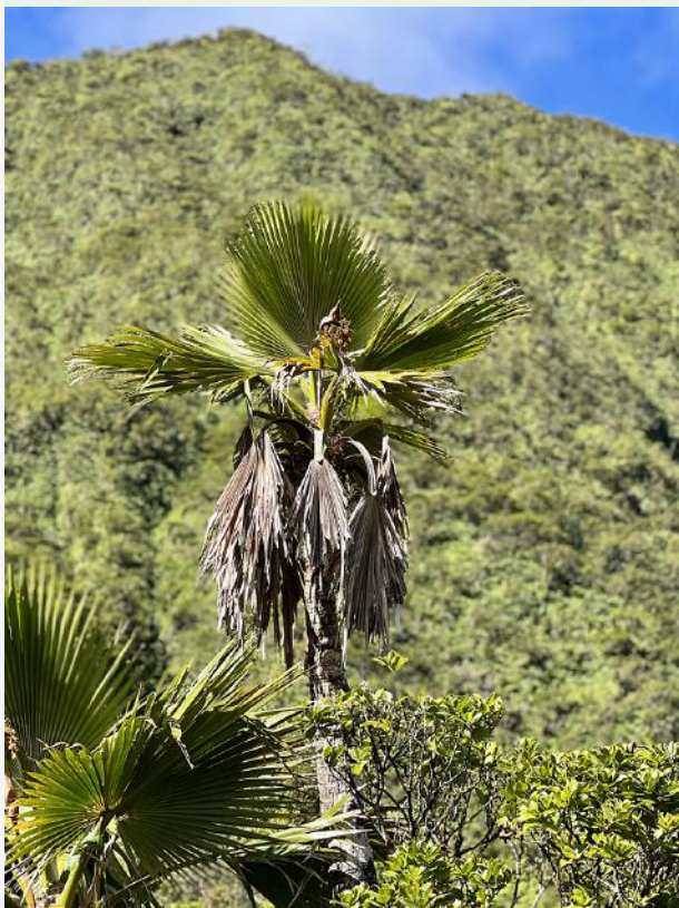
Pritchardia woodii , star of the IPS 2022 Save the Species campaign, in habitat (Waiho'i).