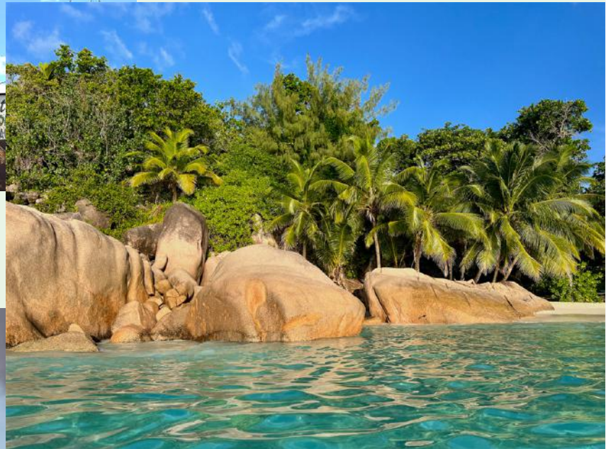
Cocos nucifera flank the borders of Anse Lazio on the island of Praslin, Seychelles.