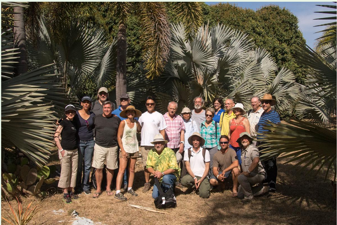
Below: 2017: Puerto Vallarta, Mexico, April 3-8. Group photo of Directors and guests.