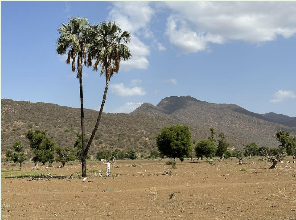
Hyphaene compressa in Omo National Park, Ethiopia.