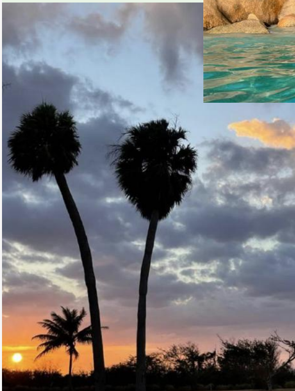
Sabal causiarum, commonly known as the Puerto Rican hat palm, in habitat. Found at Playa Punta Borinquen, adjacent to the Aguadilla, PR Airport (formerly Ramey Air Force Base), home of the longest runway in the Caribbean.