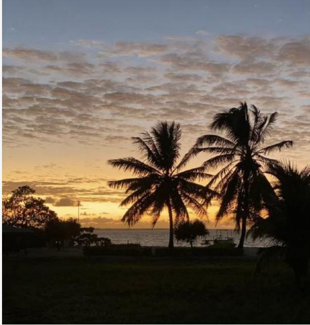
A memorable sunset from from an island rarely seen in these pages: Christmas Island, an Australian External Territory.