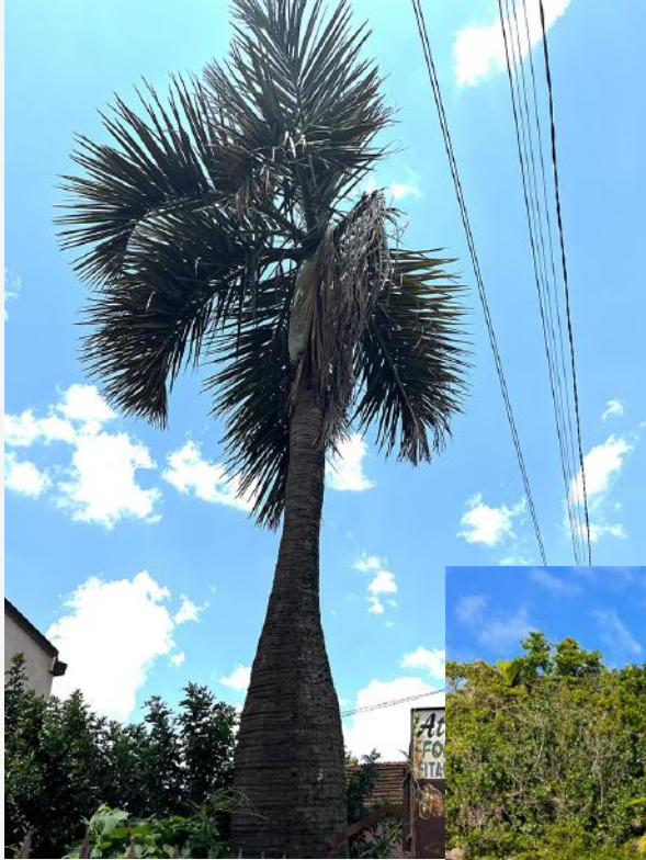
Chrysalidocarpus decipiens remnant south of Tana.