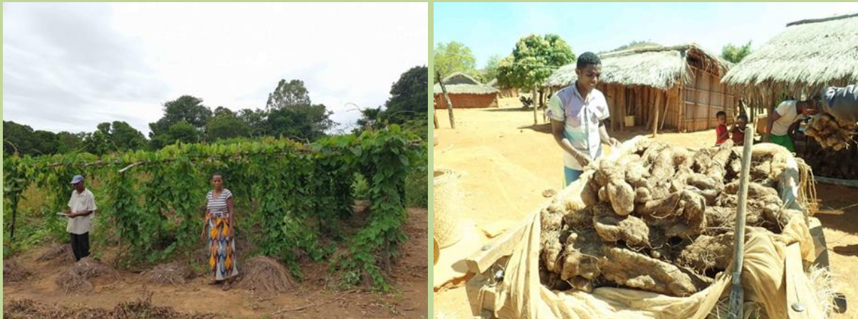
6 & 7. Household yam field and production during harvesting.