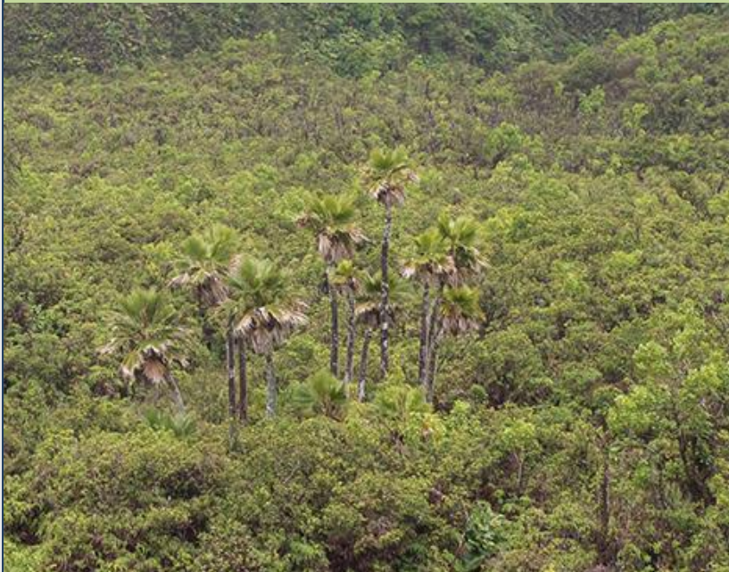
Pritchardia woodii in habitat

In my own lifetime I have seen the role of a garden, the very idea of a garden, not merely altered but reversed. Gardens, from the beginning (as the etymology of the word suggests), existed as enclaves designed and maintained to keep out the wilderness, to guard what was inside for human use or pleasure. Once it became possible for human beings to destroy environments anywhere on earth, the situation was turned around, and anyone who wanted to protect and save any remaining bit of the natural environment was acting in the role of a gardener—one whose purpose, at this point, was to keep encroaching human exploitation and disturbance out.