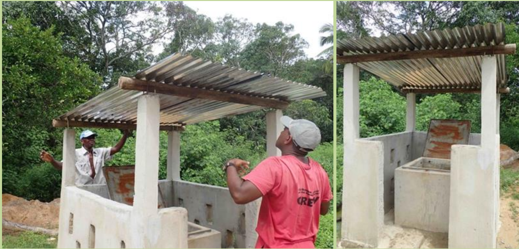
4 & 5. A well built in Amparihibe village.