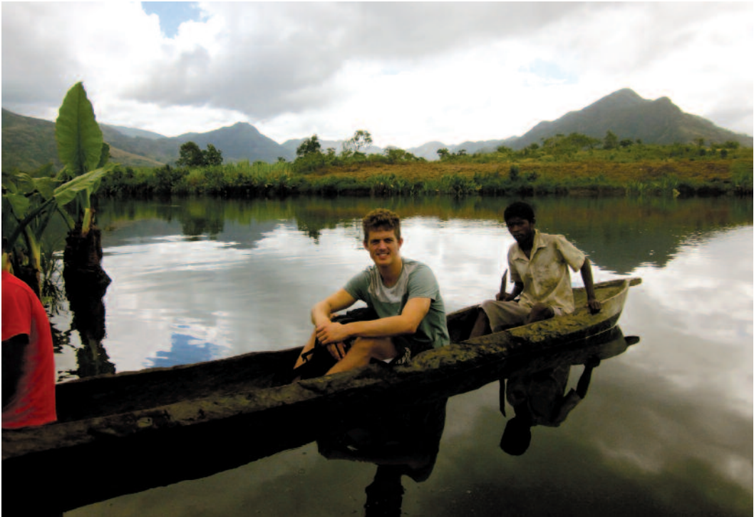
5. Searching the Ebakika River by lakana .