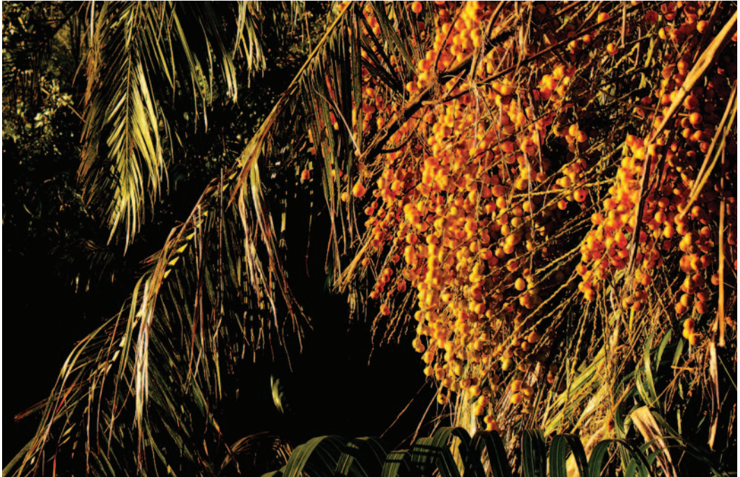
3 (top). A temporary canoe carved from the trunk of R. musicalis . 4 (bottom). Fruits.

The upstream riverine vegetation was dominated by Typhonodorum lindleyanum (Araceae), Mascarenhasia arborescens (Apocynaceae), Harungana madagascariensis (Hypericaceae), Pandanus platyphyllus (Pandanaceae), Bambusa sp. (Poaceae), Cynometra sp. (Fabaceae) and Syzygium sp. (Myrtaceae). Large, iridescent aquatic skinks ( Zonorsaurus maximus )