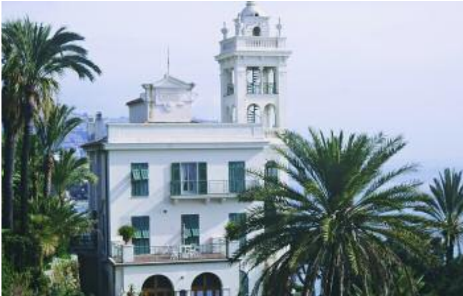
7. Villa Garnier at Bordighera with its beautiful palms.