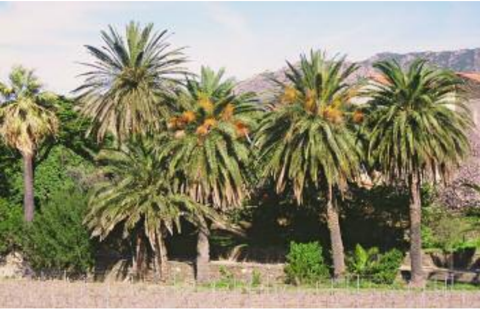
6. Phoenix canariensis and Washingtonia filifera on side of a farm in Roussillon, France. Vineyard on the foreground.