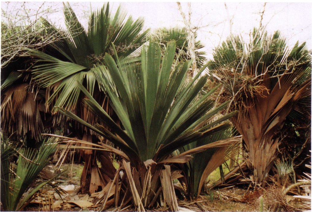
1. A stand of Copernicia\ rigida near Los Galleguitos with fire damage. 2. Striking younger plant of Copernicia\ rigida with narrow leaves.