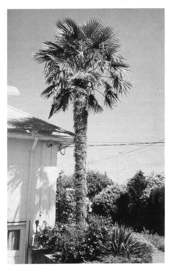
Palm on Rumble St in Burnaby planted in 1968 is Vancouver's tallest.