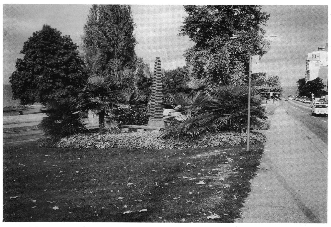
3. Successful test planting by Vancouver Parks Board on city streets in the West End. Sept. 1993.

germination, although I have seen seedlings growing naturally beneath the Pury palm. I don't believe they survive without protection.