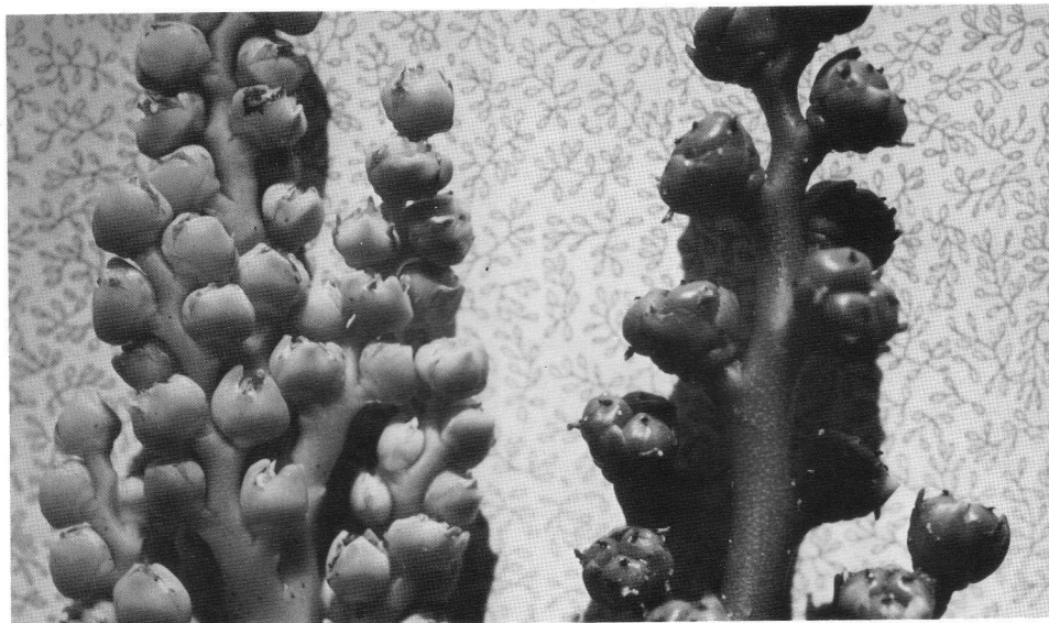
4. Female inflorescences of C. humilis . Left, inflorescence with yellow receptive flowers. Right, view of an inflorescence with developing ovaries, ten days after anthesis.

female flowers were found to secrete nectar which, measured on a weight-weight basis with a hand refractometer, yielded 27% sucrose equivalents. Accurate quantification of the amount of nectar secreted was precluded by the fact that it did not accumulate anywhere but simply glided onto the base of rachis. Nectar secretion was by no means widespread in the population, as it was observed in just few clumps. A variety of insects were attracted to the nectar which included ants ( Lasius niger L., Tapinoma erraticum Latr., Plagiolepis schmitzii Forel and Camponotus lateralis Oliv.) and, especially beetles. A single unidentified species of Curculionidae 4 mm long, Derelomus chamaeropsis (Fab.), accounted for the vast majority of insects. The same weevil has been found in every Chamaerops humilis population checked for insect visitors all through southern Spain, from the drier to the moister sites. The weevils crawl over the flowers and often slip inside the prophyll. They consistently appear at both male and female plants (up to twenty insects per inflores-