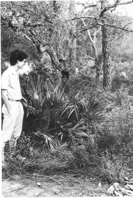
1. Habit of Chamaerops humilis L.

basaltic, granitic or limestone hillsides, and rich, deep soils on marginal areas.