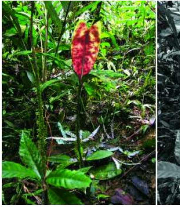
6. New leaves of G. epetiolata are very attractive to the human eye because of their colors (left). The same photograph in grayscale (right), approximates the vision of a color-blind mammal herbivore; notice how the mottling "breaks" the outline of the leaf and makes it harder to see against the background.

Most palms with mottled foliage tend to turn uniformly green when exposed to increased light levels (Tucker 1992). This provides further support for the understory camouflage hypothesis, because the mottling would be ineffective as camouflage in open areas, although Ferrero (2006) reported that the strongly mottled Licuala mattanensis can tolerate full sun. The camouflage hypothesis,