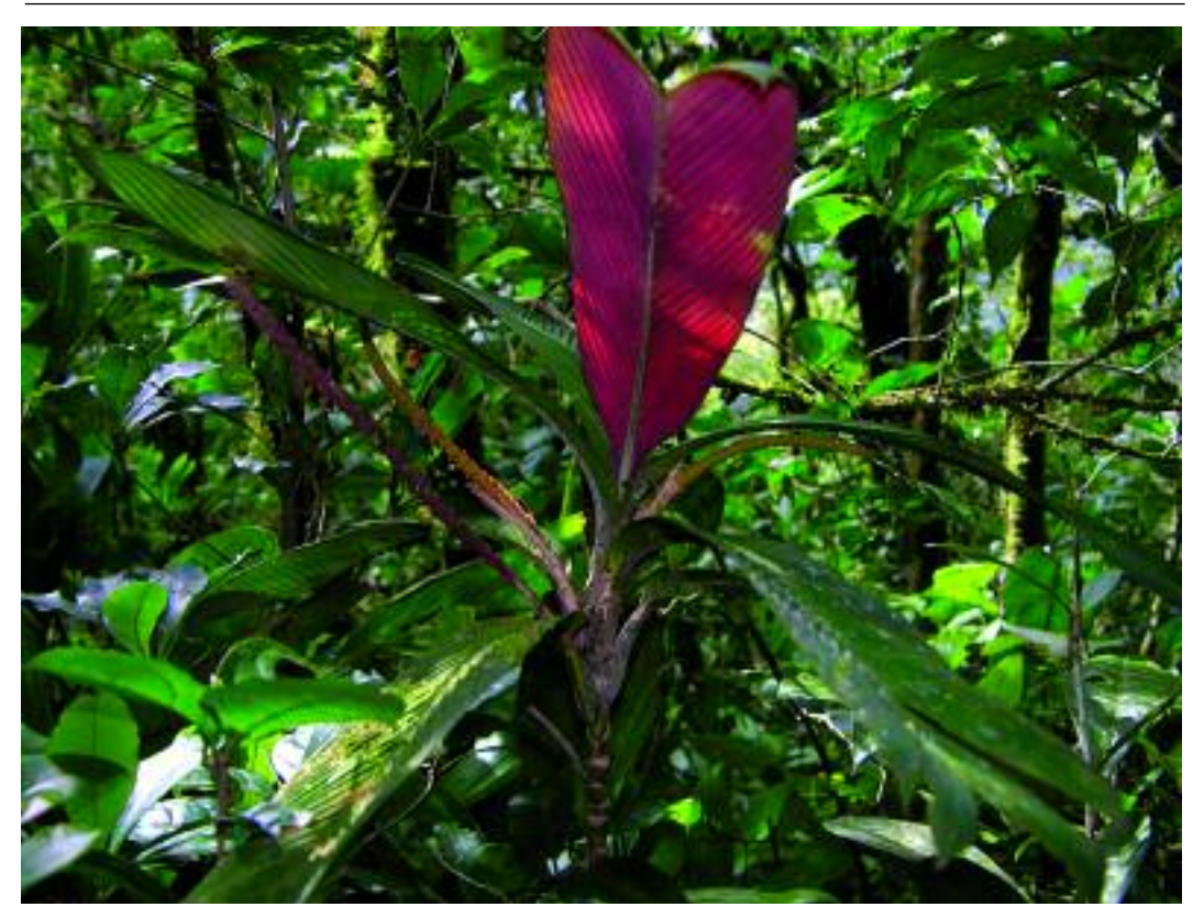
4. Only the youngest leaf shows the red underside. Notice three inflorescences, one with fruits.

the leaves can be proportionately wider, up to 2.5 times as long as wide; variation in leaf proportions has also been noticed by other observers (see Gray 2006). When fully expanded, young leaves appear wider than mature ones. During preparation of herbarium specimens the leaves seem to become somewhat narrower, probably because the plications become more pronounced after drying.