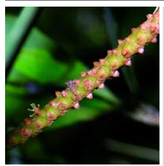
5. Few male flowers are produced per day on each spike.

the impoundment of debris is an adaptation to increase the quantity of nutrients available to the plant. When it rains, nutrients from the decomposing debris leach to the base of the stem and toward the roots.