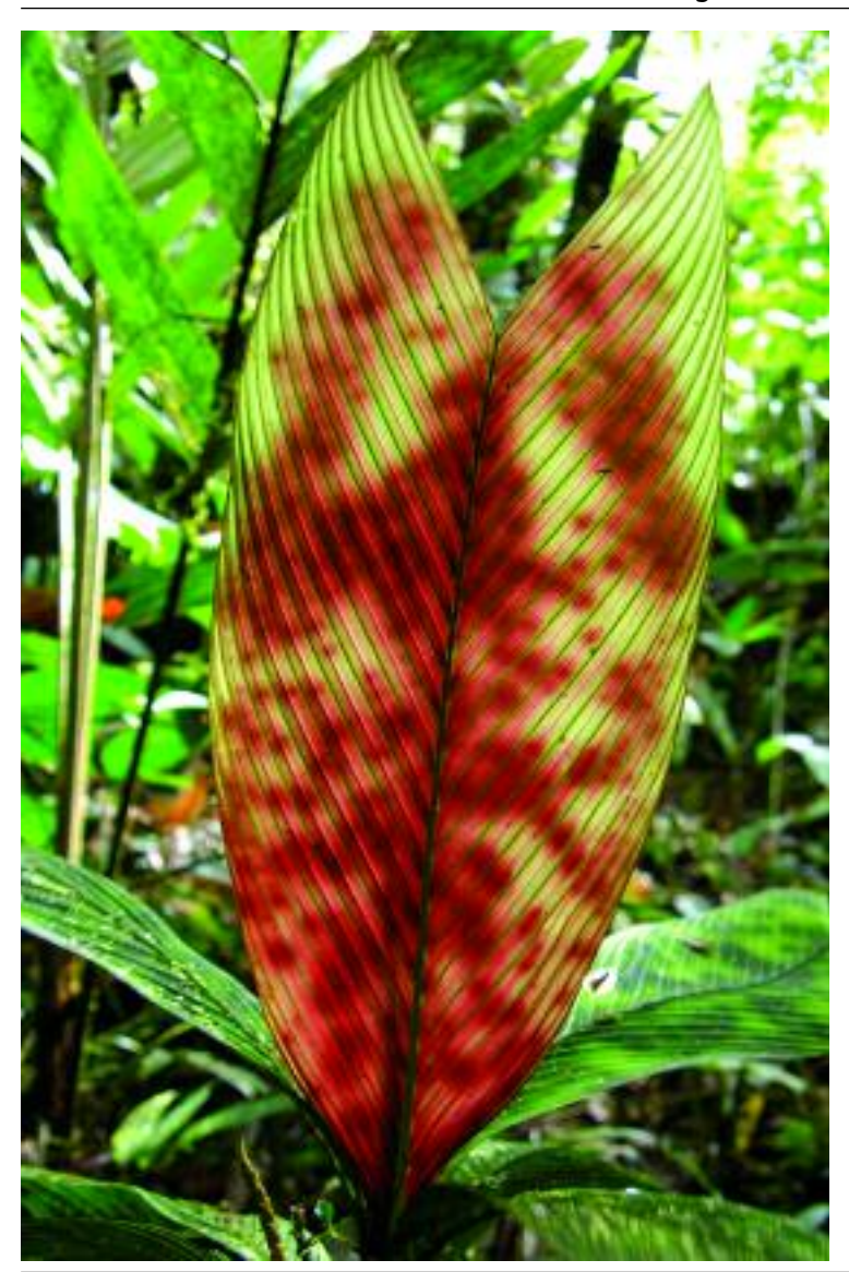
3. New leaves are almost completely devoid of chlorophyll while expanding.

10 meters were recorded in 1997. This precipitation falls aseasonally throughout the year, although there are occasional dry spells. Even between rains the sky is almost always overcast. Consequently, the understory is generally very dark. The plants grow in the understory of primary forest on poor lateritic soils, but with abundant leaf litter on the soil surface.