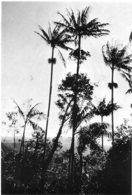
3. A windblown group of Clinostigma collegarum.

\pm scopiform ca. 8 exposed at any time, erect at anthesis, ca. 70 cm long, increasing somewhat with age, and becoming \pm horizontal; base of peduncle with 2 wings encircling the stem, to 14 cm wide in all; base of peduncle flattened at anthesis, swelling grossly as the fruit develops, to form a bulbous boss to ca. 4.5 cm thick, pushing the inflorescence away from the trunk; bracts 2 only, the inner partially preserved glabrous; first order branches spirally arranged, ca. 20 in all, the apical unbranched, the basal soon branching to produce up to 48 rachil-