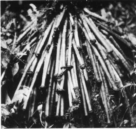
4. The stilt-roots of Clinostigma collegarum (photo. M. J. S. Sands).

somewhat shorter than the petals, with filaments to 1.5 mm and anthers to 3 \times 0.7 mm; pistillode conical to 15 mm. Pistillate flower in bud globular, ca. 5 mm diam.; sepals 3 imbricate, \pm rounded, to 3 \times 3 mm; staminode minute; ovary somewhat conical. Fruit ripening from yellowish to scarlet, borne on the enlarged perianth whorls; mature fruit \pm ovoid, to 12 \times 8 mm, bearing the stigmatic remains on a short subapical beak to 2 \times 1.5 mm, usually less; epicarp drying \pm smooth; mesocarp apparently thin; endocarp thin. Seed ovoid, ca. 9 \times 6 mm, with longitudinal hilum; endosperm homogeneous; embryo \pm basal (Fig. 1).