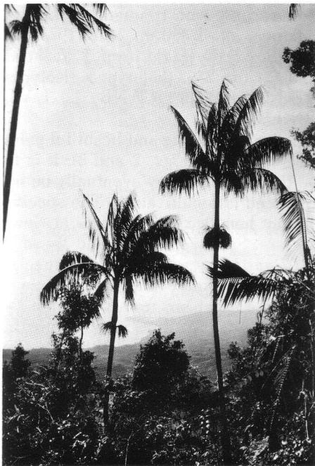
2. View through the crowns of Clinostigma collegarum from the mountain ridge top to the coast of New Ireland.