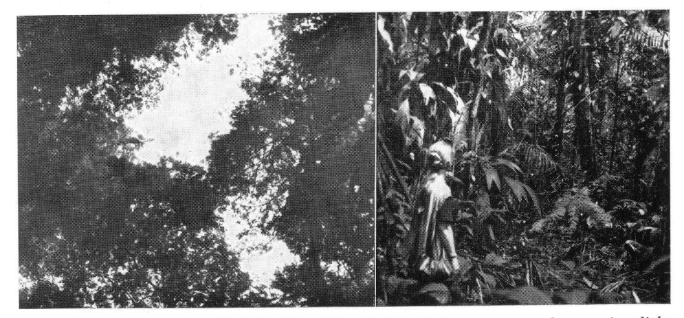
1. A light gap in the forest at La Selva, Costa Rica. Left, typical canopy cover above a minor light gap; Right, understory in the same light gap.