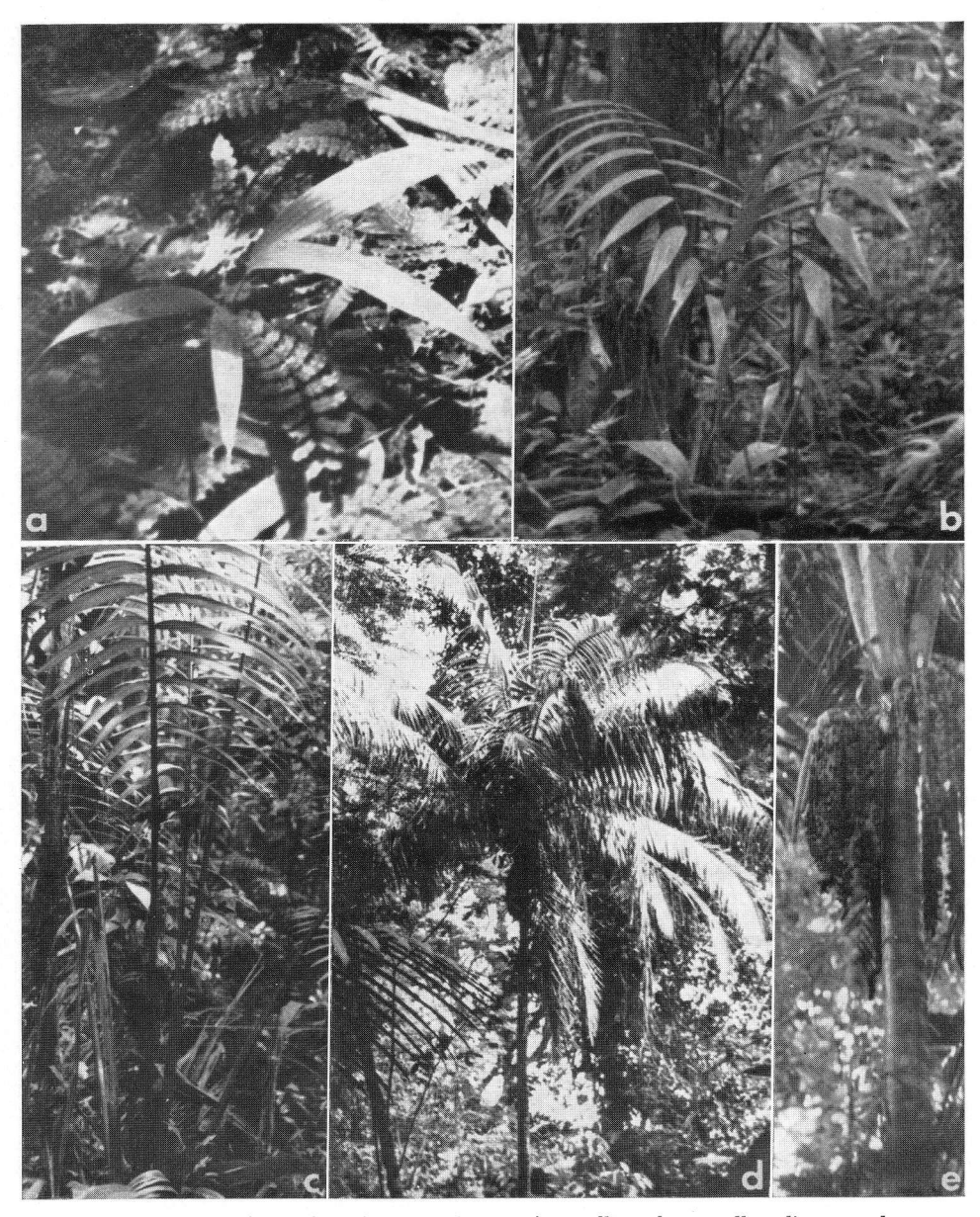
2. Welfia georgii at La Selva, Costa Rica. a, closeup of a seedling; b, a small sapling; c, a large sapling; d, an adult; e, closeup of Welfia infructescences. Note inflorescence at left with male flowers.

Our method of estimating the relative growth rates of individuals rests on a knowledge of the developmental morphology of the palm leaf. Consider the growth pattern of Welfia . Upon ger-