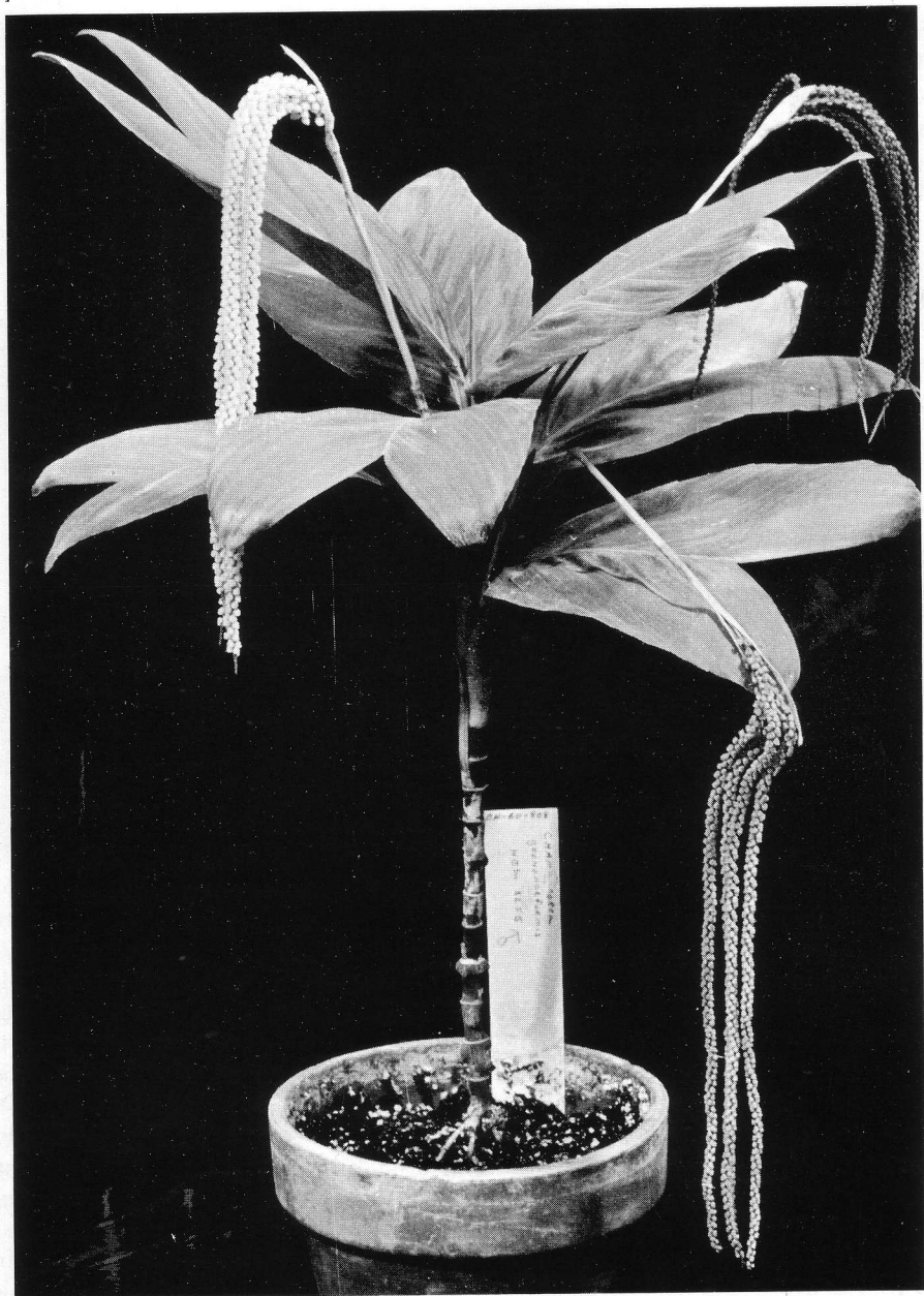
4. A male plant of Chamaedorea geonomaeformis with pendulous inflorescences of yellow flowers. True S. tenella may be no more than an altitudinal form of this species with narrower leaves.

It is noteworthy that the leaves in C. metallica are normally undivided but rarely are divided into pinnae, as on one staminate plant at Ithaca and one or