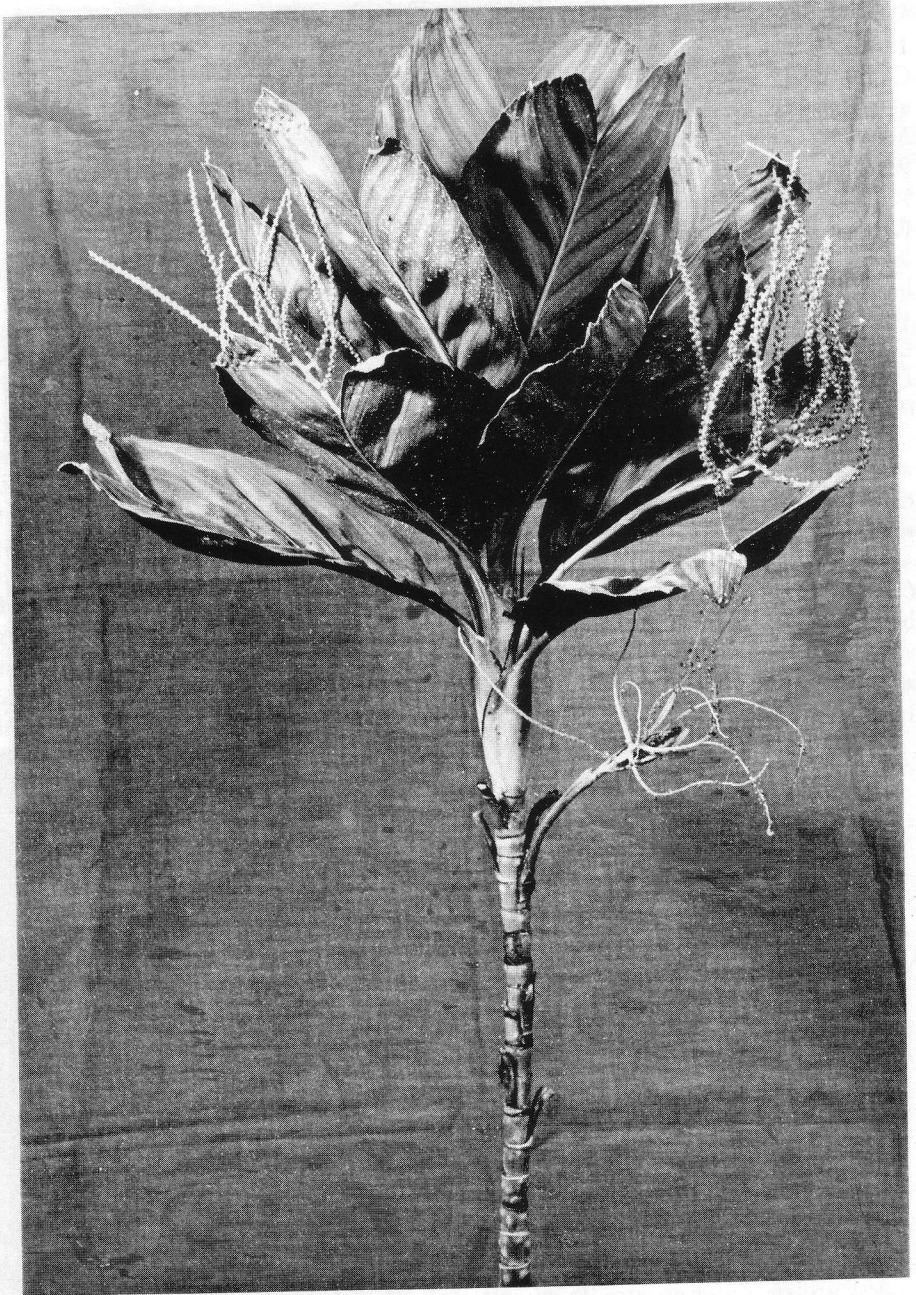
2. A male plant of Chamaedorea metallica .

diam.; mesocarp thin, fleshy, green with slender elongate or branched flat fibers appressed against the thin endocarp; seed 10 mm. long, 7 mm. in diam.,