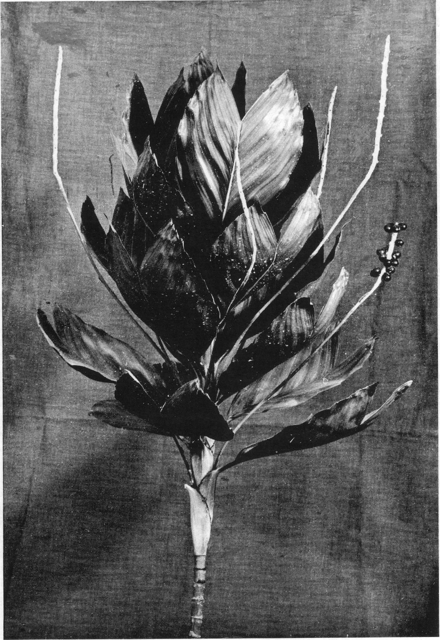
1. A female plant of Chamaedorea metallica from which the type specimen was taken. Note the angle at which the spike is borne.

in the lower half but readily separable, stigmas 3, recurved, ovules attached near the base of the locule. Fruit dull