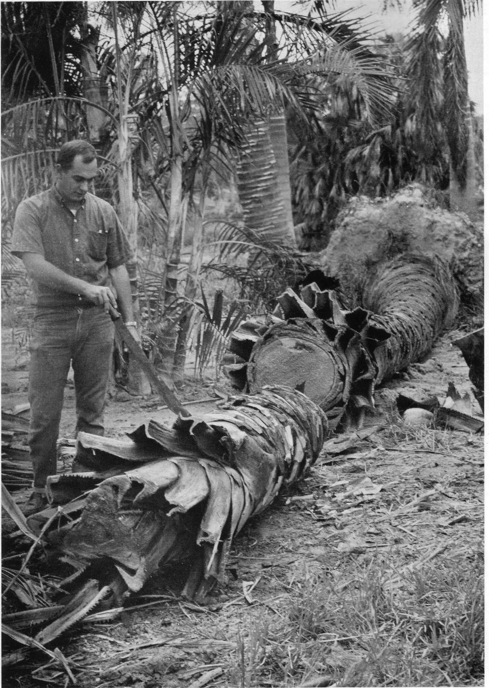
1. Corypha elata , preliminary cuts and trimming.