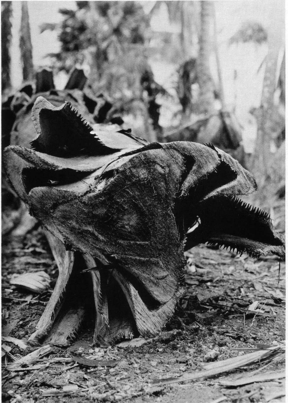
4. Base leaves of Corypha elata sawn across. Three leaf-contact spirals (parastichies) are conspicuous as also are saw-like margins of petioles.