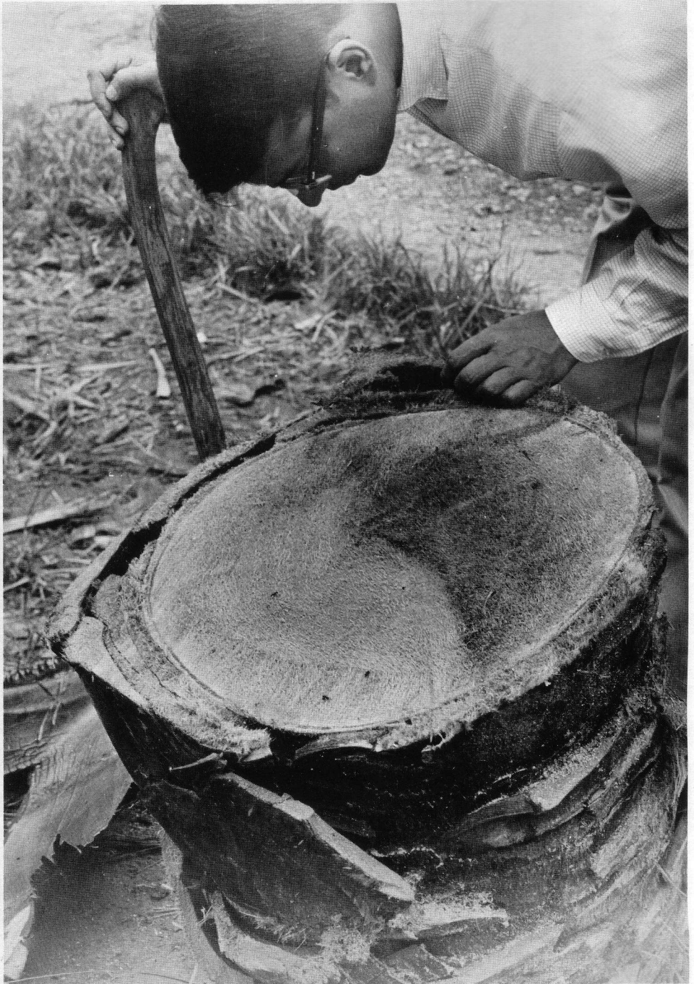
3. Sawn surface of stem of Corypha elata showing frayed broken ends of innumerable vascular strands.