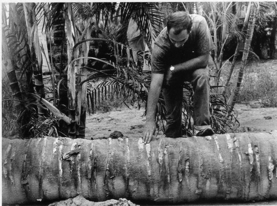
2. Stem of Corypha elata before sampling.

"Dissection" is something of an euphemism, since the palm was cut up with a chain-saw, but a chain-saw is undoubtedly the best tool for disassembling such a large plant (Fig. 2). All but the base of the leaves were first trimmed with a machete and a saw-cut was made to isolate the crown, well below the stem apex