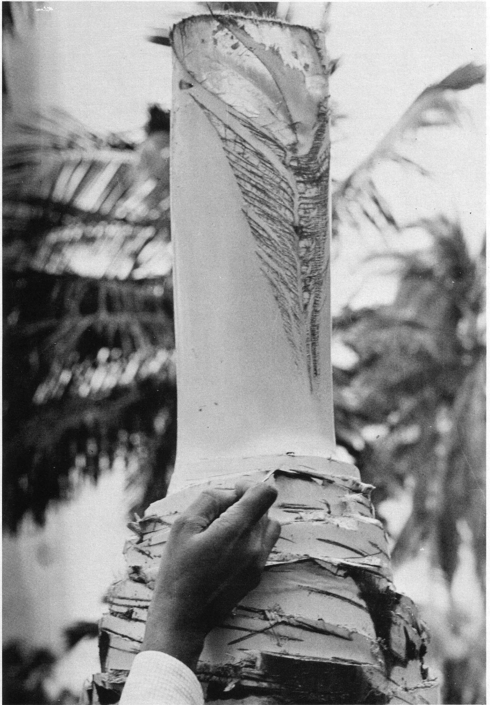
6. Tubular base of young leaf.