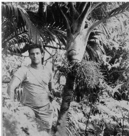
12. Lepidorrhachis in young fruit on Mt. Gower.