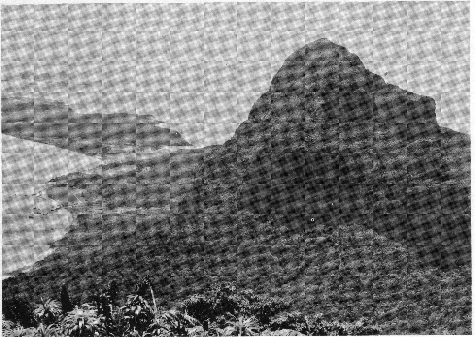
2. Mt. Lidgbird and central Lord Howe Island from trail to Mt. Gower.