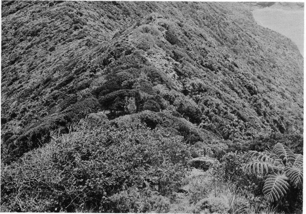
7. Hedyscepe crowns rise above low forest on ridge between Mts. Gower and Lidgbird.