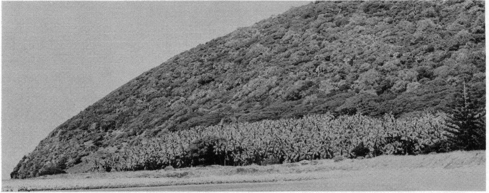
15. A grove of Howeia Forsteriana , North Beach at north end of island.