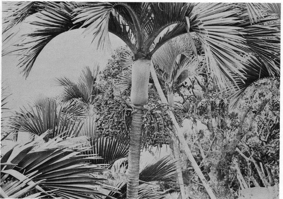
8. A close-up of Hedyscepe Canterburyana in fruit.