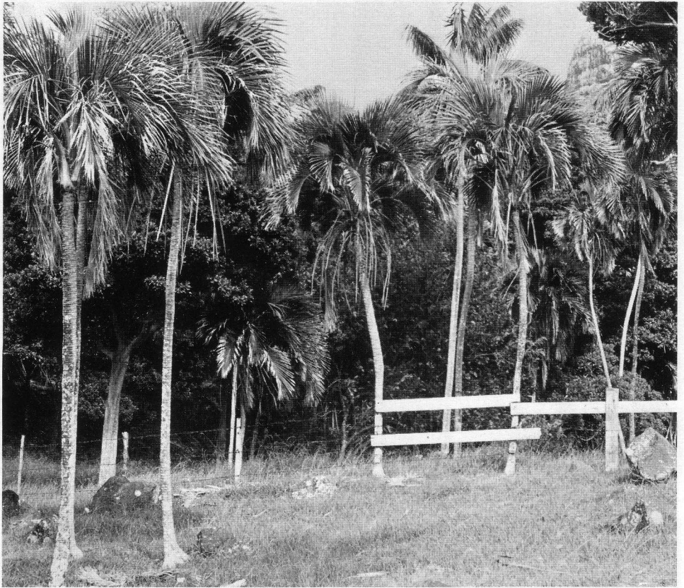
3, 4. Howeia Belmoreana (above) and H. Forsteriana (below and background above) at end of road near base of Mt. Lidgbird.