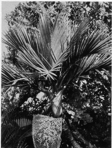
13. Wire netting is needed to keep rats from harvesting fruits of Lepidorrhachis .