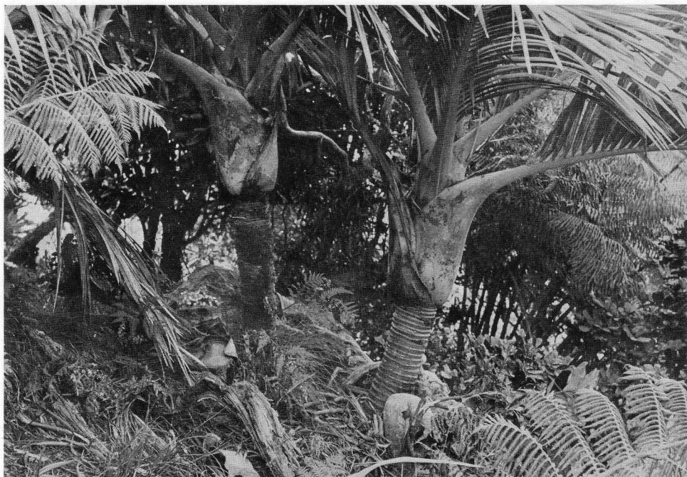
11. Lepidorrhachis Mooreana on Mt. Gower is less imposing than Hedyscepe . Note that the leaf sheaths form a much less prominent crownshaft.