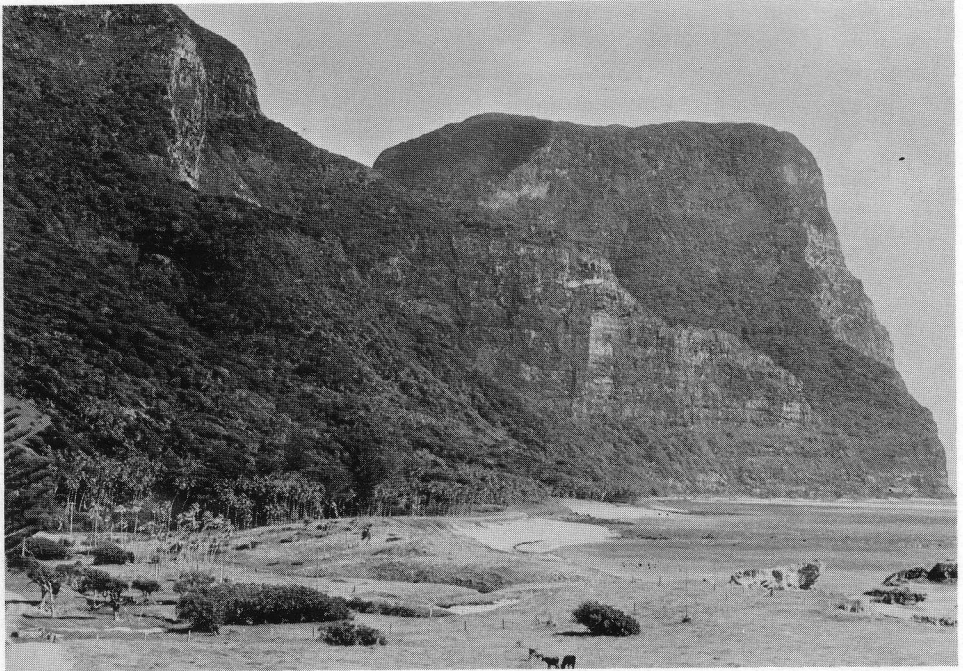
1. Mt. Gower (right) and base of Mt. Lidgbird with Howeia Forsteriana on sands back of beach.