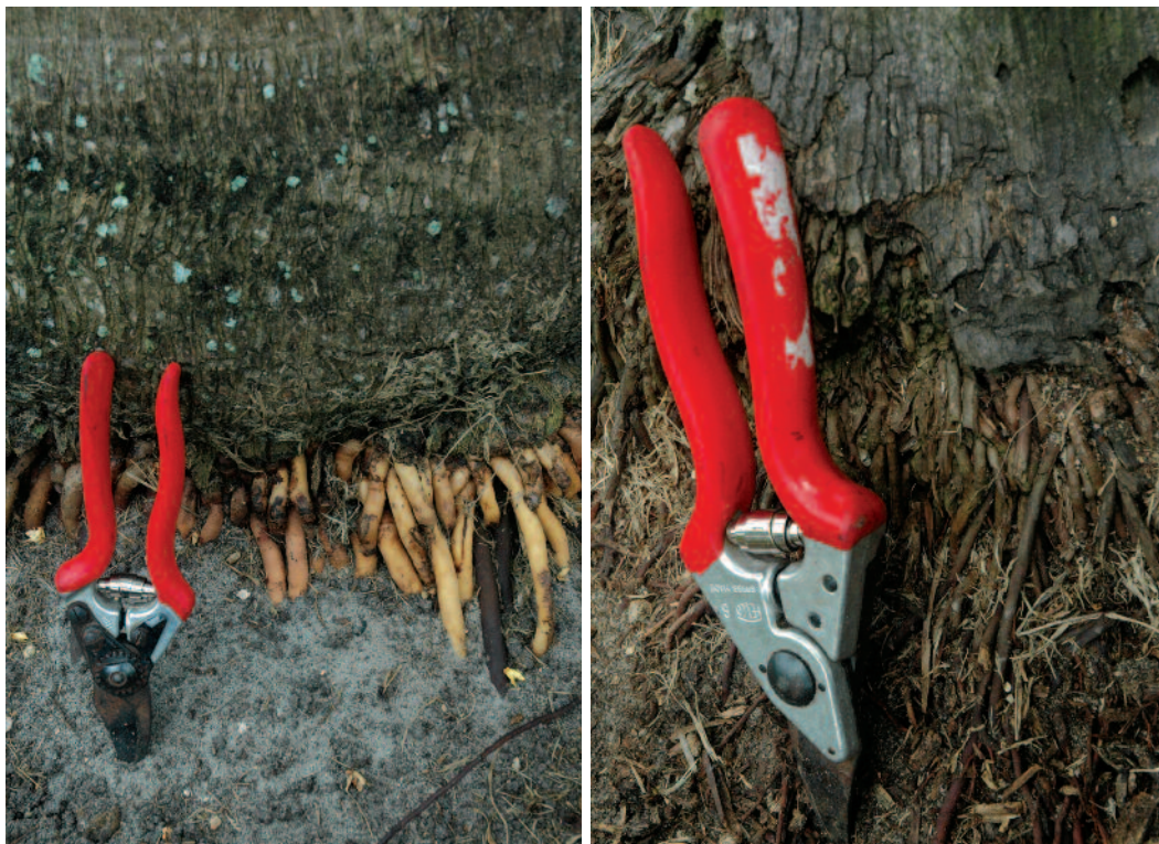
6 (left). Syagrus amara (MBC 20030597*A); see also Figure 3. Roots of this species are exceptionally robust within the genus, with diameter often reaching over 1cm. 7 (right). Syagrus botryophora (MBC 941217*F); see also Figure 4. Roots of S. botryophora are much thinner (Table 1) compared to S. amara (Figure 6).

shape, from very stout palms (e.g. C. spissa , Fig. 4), to very tall, slender plants (e.g. C. barbadensis ), yet all are consistently windproof. So we return to that previous question of “how?”