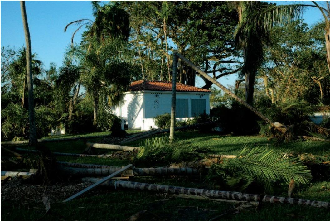
5. Syagrus botryophora collections at MBC the day after Hurricane Wilma (October 25, 2005). These were grown from seed collected in 1994, in Bahia, Brazil, and were thus 11 years old in this photo. These are relatively tall and thin Syagrus (Average H/D = 57.2). See also Figure 7.

shape – is confirmed for Syagrus , and rejected for Coccothrinax . Coccothrinax is invariably windproof in this analysis, regardless of its trunk shape. Although the regression slope for Coccothrinax was significantly greater than 0, the magnitude is so small (4%) as to be effectively negligible, and certainly far lower than for Syagrus , which as a genus has an essentially 1:1 relationship between H/D and % mortality.