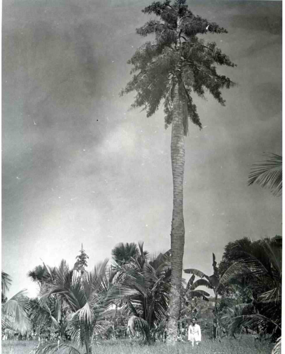
"Buri Palm in fruit", Philippines

If you haven't yet plugged this special flash drive into your computer, it is highly recommended you do so, but only when you'll have enough time to get lost in the history of Dr. Fairchild's 1940 official collecting expedition for FTBG, sailing from the Philippines to the Indonesian archipelago on a special oceangoing Chinese junk