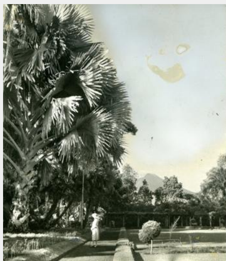
“Ned and I crept through the jungle and waded through the swamp to see this group of magnificent Pigafettias , a hundred feet or more tall...”