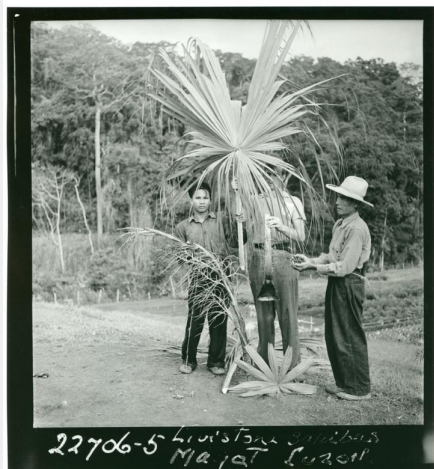
“ Livistona frond and fruit ” Below, “ A Corypha palm in Buitenzorg ”, Bogor, West Java, Indonesia