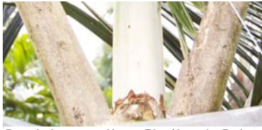
Dypsis leucomalla at Floribunda Palms, Hawaii

BECOME AN IPS MEMBER TODAY JUST $45 A YEAR!