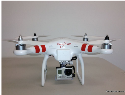
Photo of a DJI Phantom

Day One of the IPS Biennial will conclude with a barbecue at the Searle Brothers Nursery in Broward County, Florida. For a preview of this extensive operation, see this incredible video made using a Quadcopter and a GoPro camera similar to the photo at right.